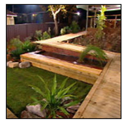
Screen: A simple screen was built using 90x90mm treated pine posts with 90x45mm rails to stabilise the framework and Natureed was then stapled onto the frame.

Water feature: As we had a structure around the water feature, it was not necessary to dig into the ground. We prepared an even flat surface and installed a fibreglass pond.