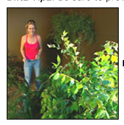
lilly pilly (Syzygium 'Cascade')